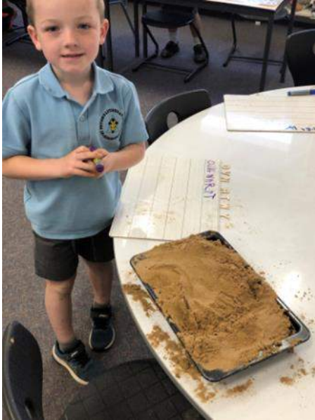
“Searching for Capital Letters in the sand”