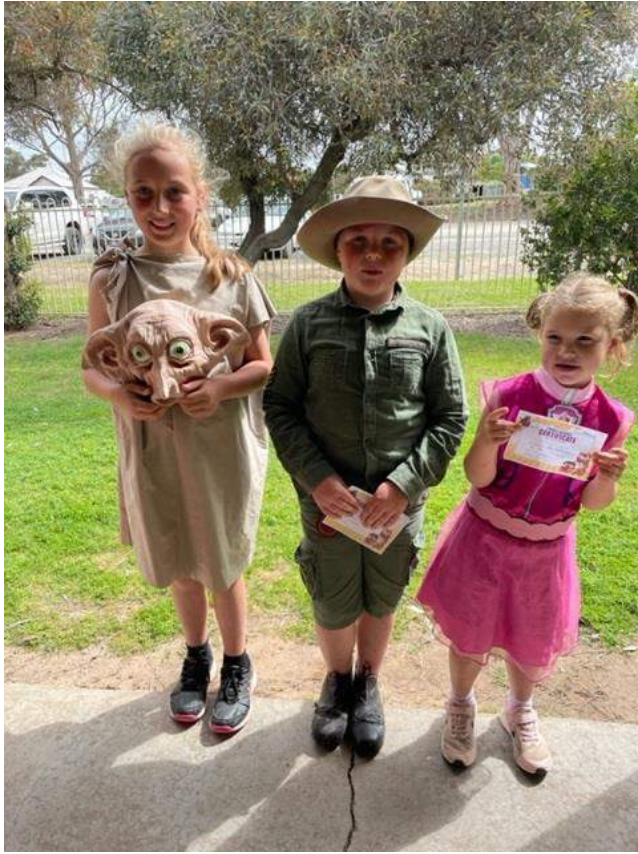
Book Week parade awards “Best dressed Juniors and Seniors”